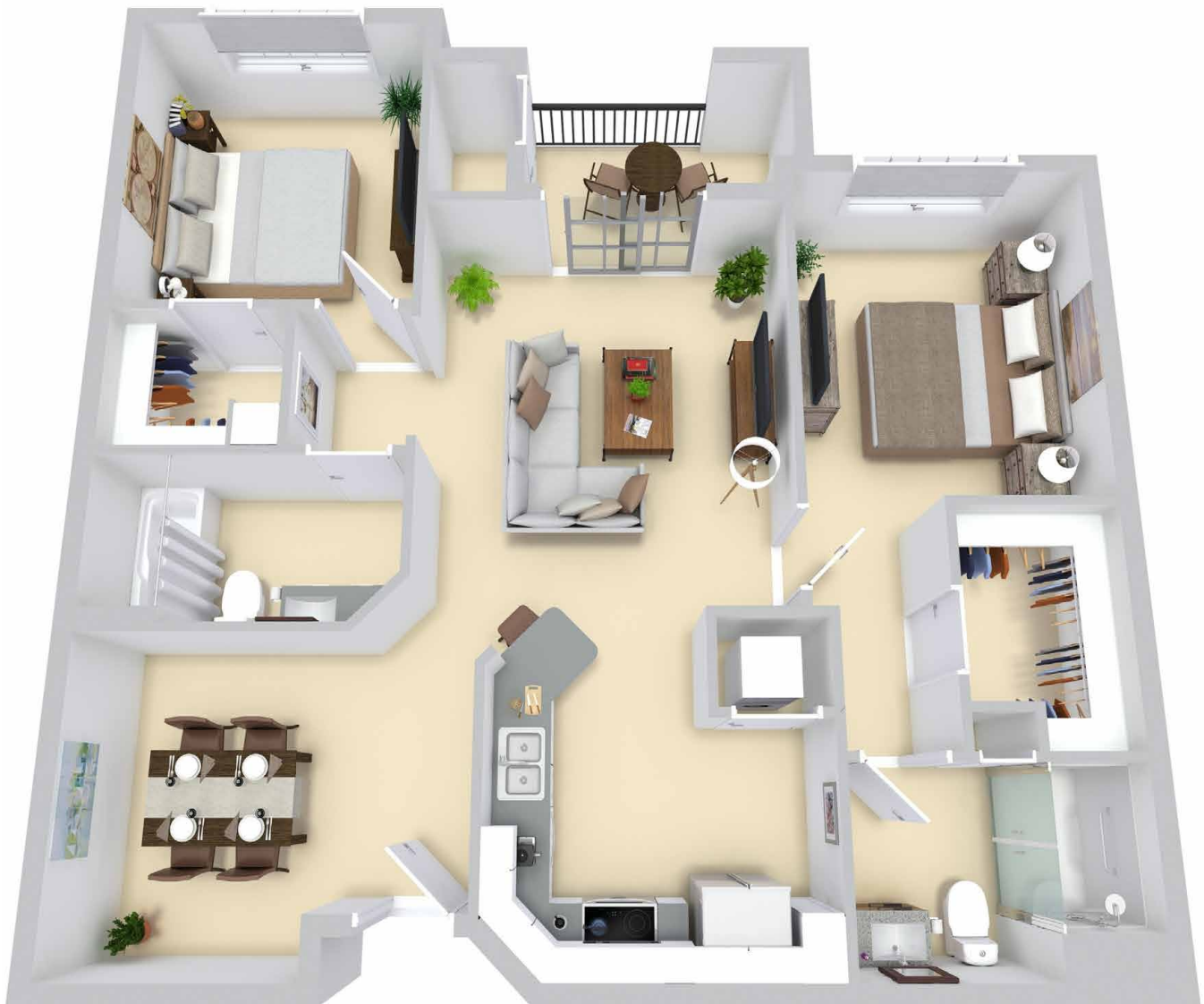
Floor plans are representative; actual square footage, dimensions and details may vary.

909 East Northern Avenue • Phoenix, AZ 85020 • P: 602.870.5500 • F: 602.870.5501