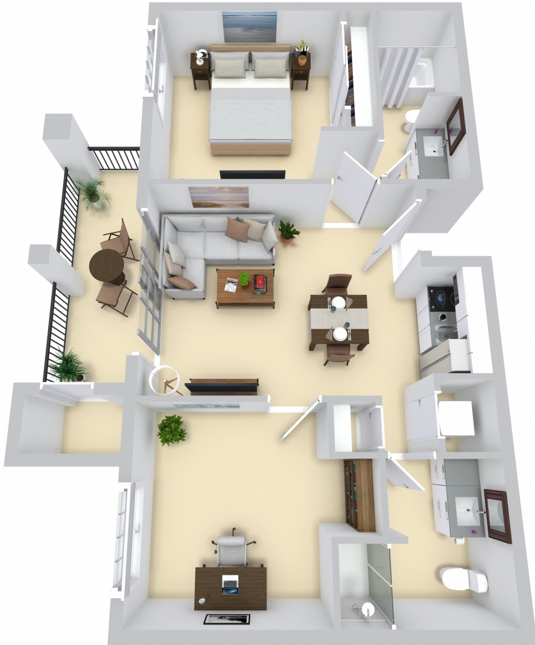
PLAN II | 800 SQ. FEET | One Bedroom + Den / Two Bath

Floor plans are representative; actual square footage, dimensions and details may vary.