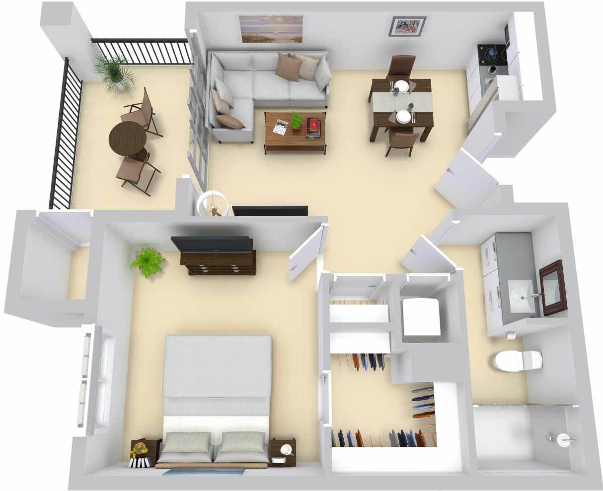
PLAN I | 600 SQ. FEET | One Bedroom / One Bath

Floor plans are representative; actual square footage, dimensions and details may vary.