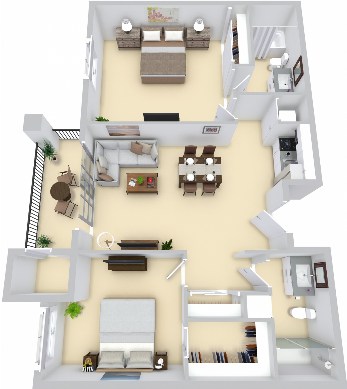
PLAN III | 1050 SQ. FEET | Two Bedroom / Two Bath

Floor plans are representative; actual square footage, dimensions and details may vary.