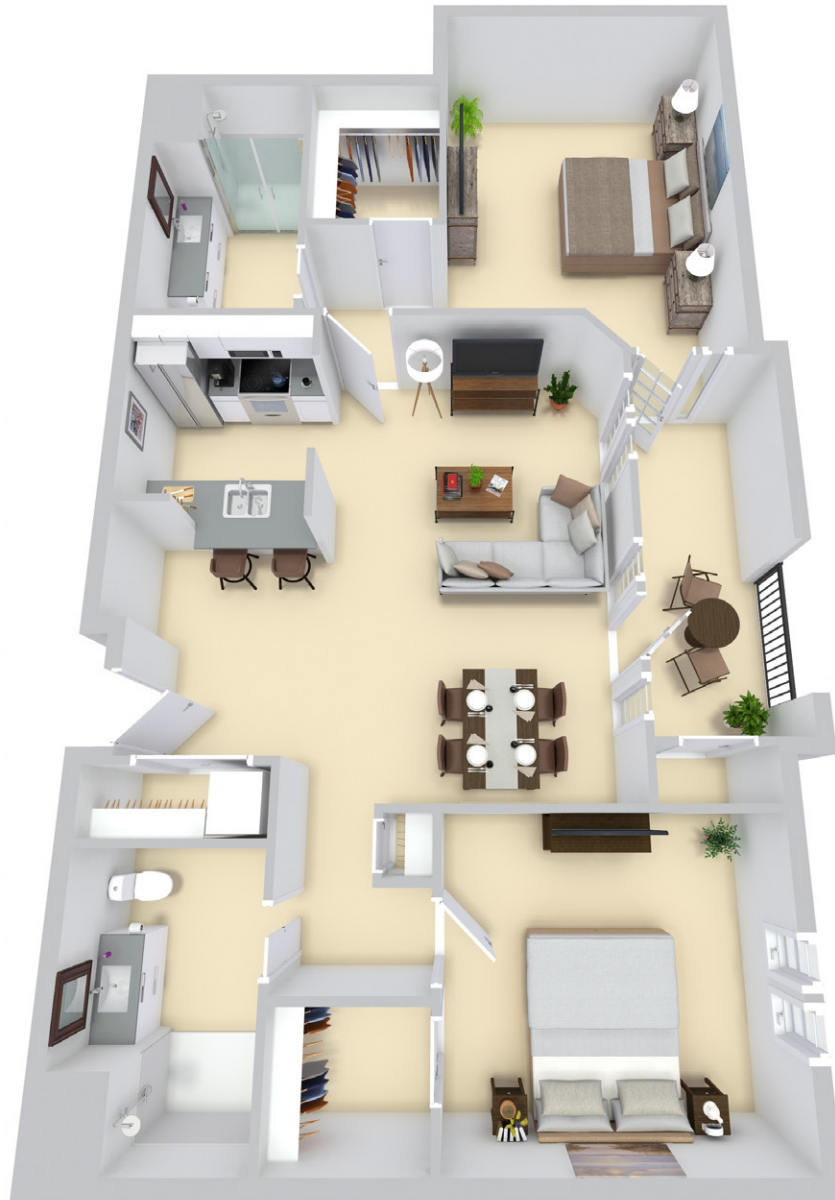
PLAN G | 1,278 SQ. FEET | Two Bedroom Deluxe / Two Bath

Floor plans are representative; actual square footage, dimensions and details may vary.