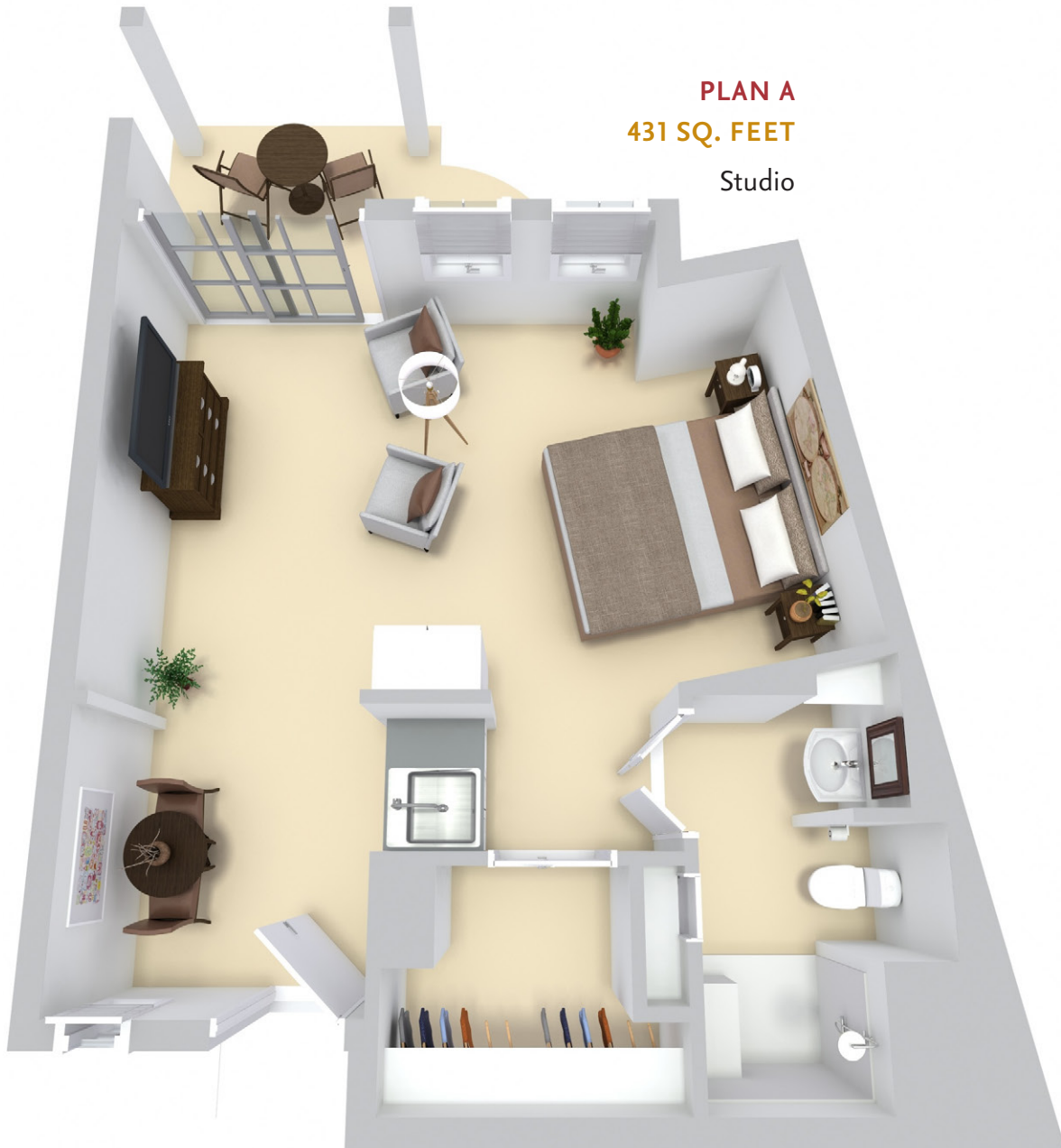
PLAN A 431 SQ. FEET Studio

Floor plans are representative; actual square footage, dimensions and details may vary.