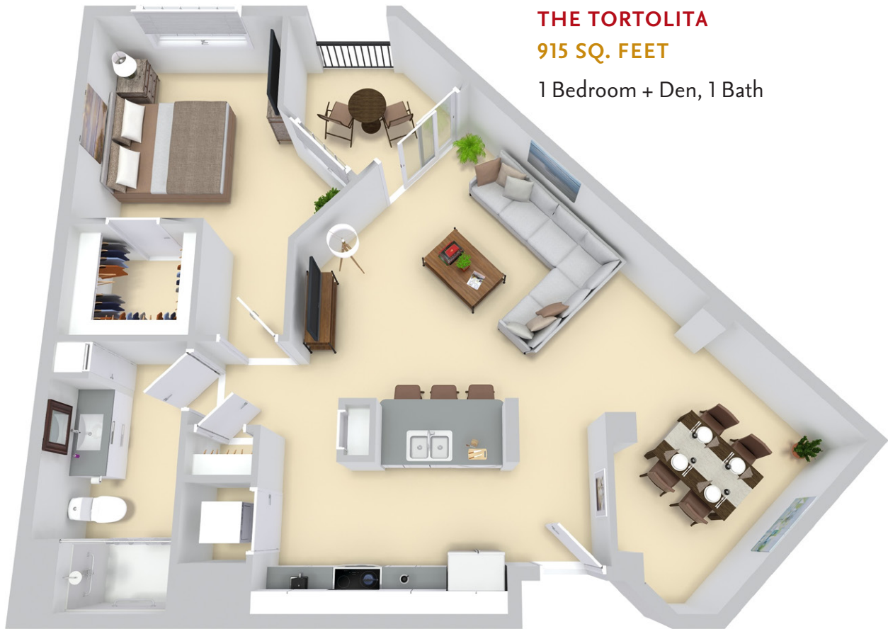
THE TORTOLITA 915 SQ. FEET